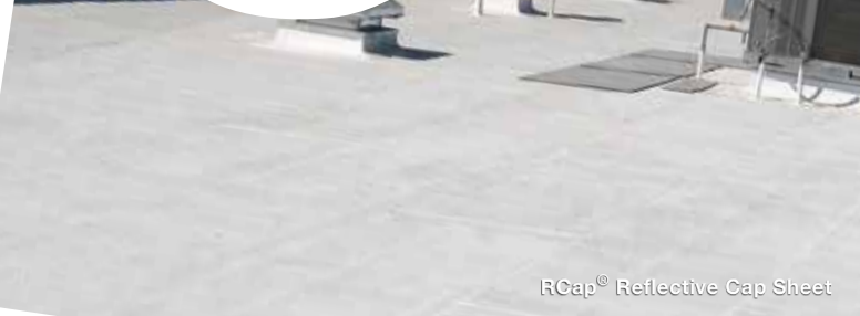
RCap ® Reflective Cap Sheet