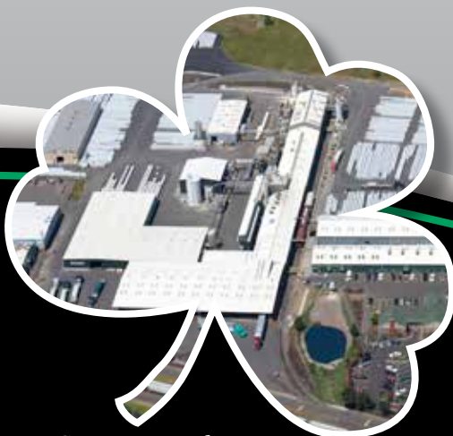
Corporate Headquarters Portland, OR

Malarkey expands from the Pacific Northwest and California with a manufacturing plant in Oklahoma City, OK