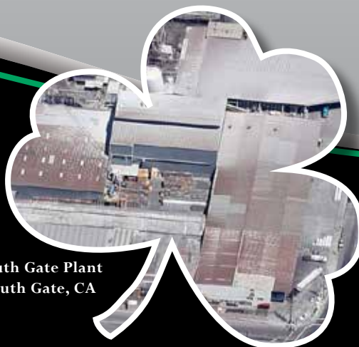
South Gate Plant South Gate, CA