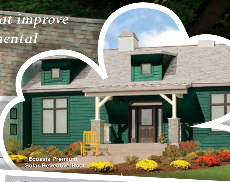
Ecoasis Premium ™ Solar Reflective Roof

“ Committed to developing products that drive quality amongst the commercial roofing industry. ”