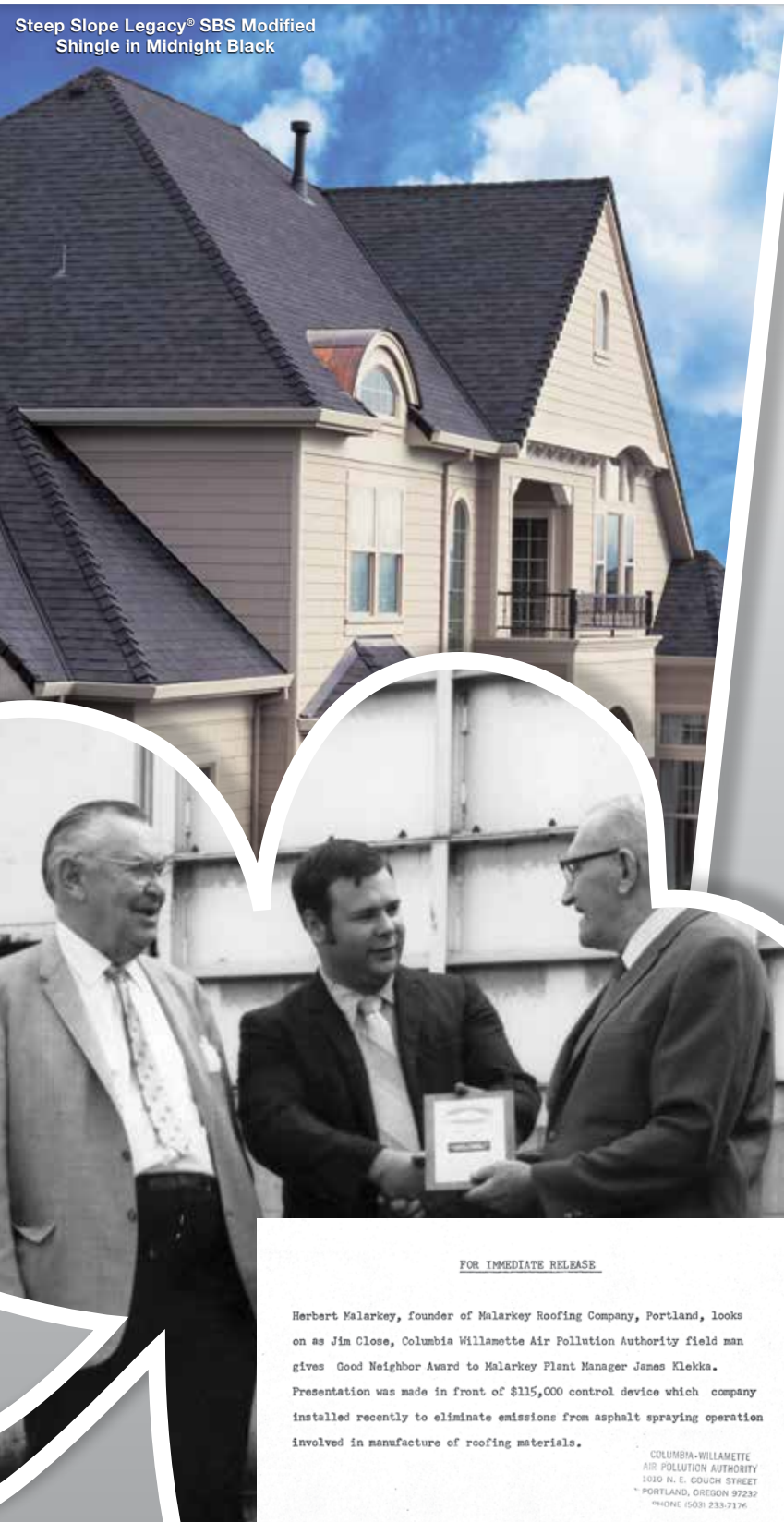
Steep Slope Legacy® SBS Modified Shingle in Midnight Black

With more than 300 employees working in three different manufacturing facilities in North America, Malarkey Roofing Products® is one of the leading manufacturers of commercial and residential roofing products. Since 1956, Malarkey has operated as a family owned, professionally managed, privately held company, headquartered in Portland, OR.