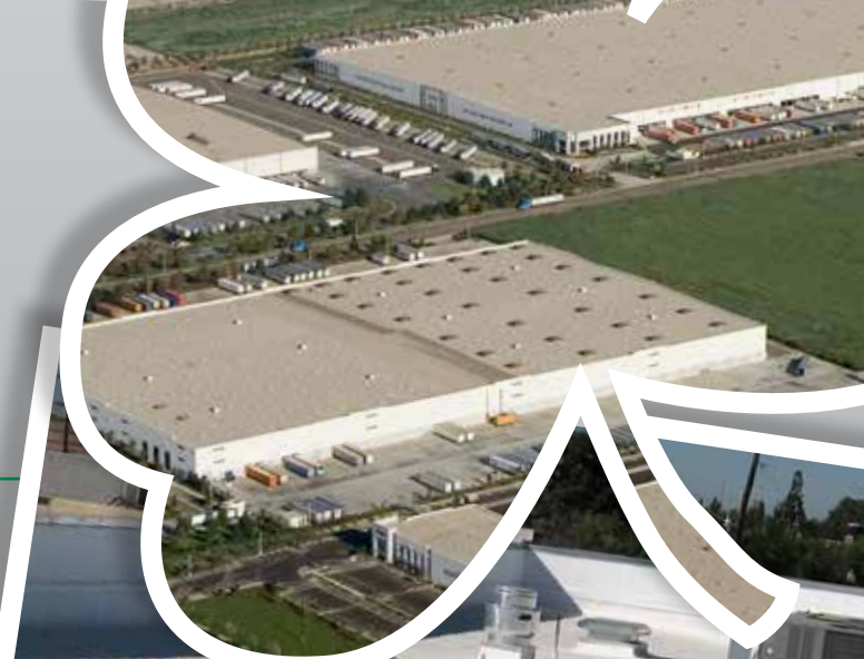
Commercial Multi-ply System Roofing Project