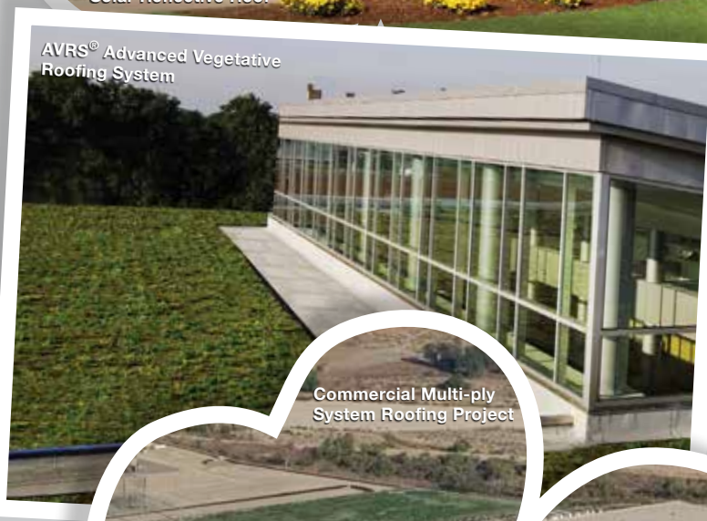
AVRS ® Advanced Vegetative Roofing System