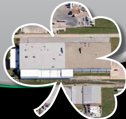
Oklahoma Plant Oklahoma City, OK

Malarkey Roofing Products 3131 N. Columbia Blvd. Portland, OR 97217-7472 503.283.1191 | 800.545.1191 Fax: 503.289.7644